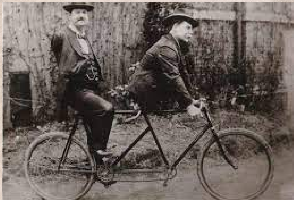
THE ARMLESS AND LEGLESS MAN